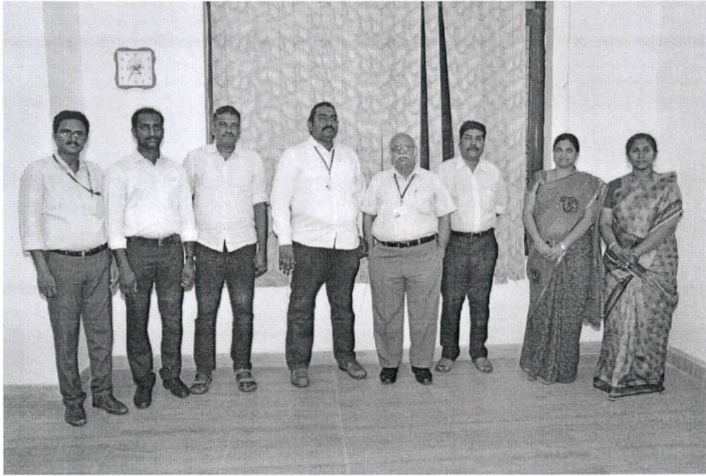
BEC Speaking Test Team with Dean T&P and Head, Training Cell on 3 March 2018